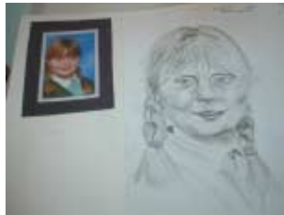
Credo members try sketching loved ones: a dear pet and a beloved daughter....