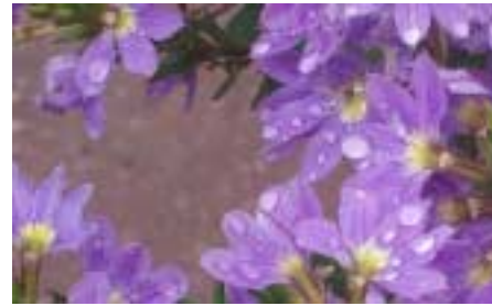
The wonders of the Scadbury Park Nature Reserve in Orpington