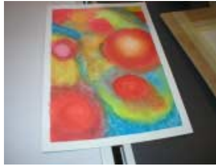
Trying out new techniques with watercolour for the first time....