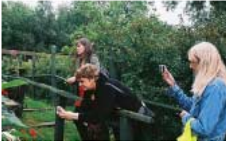
What a picture! Getting the composition right