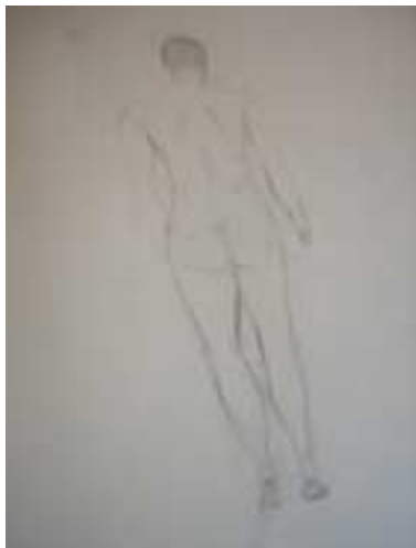
Adventurously drawing the human form – and getting it right first time!