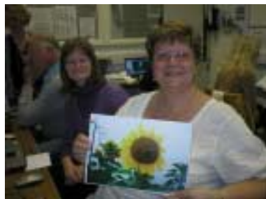
..... downloading and printing..... result!